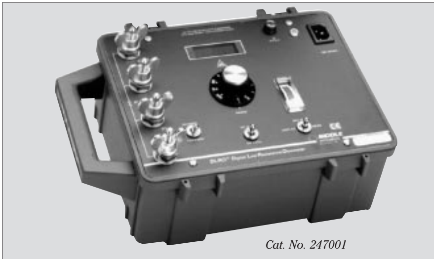
Cat. No. 247001