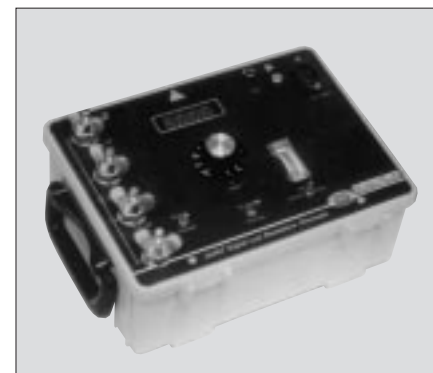
The Low-Range DLRO, Cat. No. 247002, features an extra range and rugged, Single-Pak design.

For 100 ampere measurements, an interconnecting cable from the 100 ampere current supply module is plugged into a special receptacle on the measuring module.