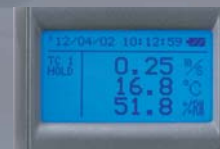
LCD display with bright backlight