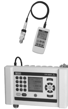
Fig. top: Hand-Held pressure instrument Model CPH6200