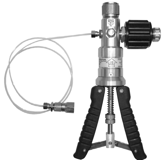
Test pump CPP30