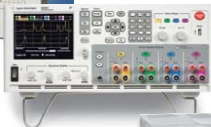
Agilent N6705A DC power analyzer