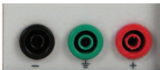
The 9120 series uses 4mm sheathed banana jacks that accept sheathed or shrouded banana plugs and meet the latest international safety standards.

Accessories Supplied: User manual, line cord, RS232 communication cable, Software Installation disk. Model 9123A also includes GPIB to TTL Serial Converter cable IT-E135 Optional: IT-E132 USB to TTL Serial Converter cable , IT-E151 rack mount kit.