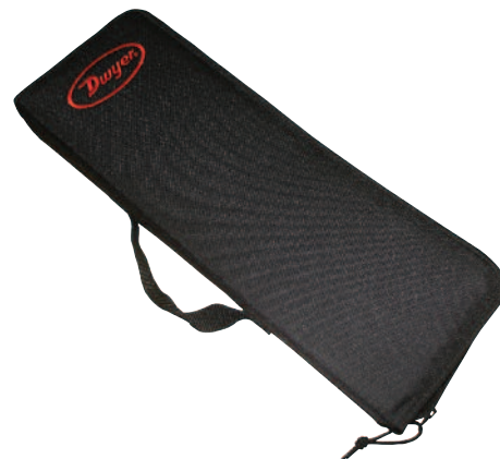
Soft Carrying Case Included with Every Unit