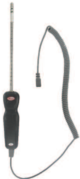
Replaceable Probe with Secure 6 Pin Adapter