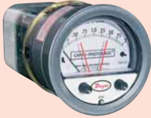
Series 43000 Capsu-Photohelic® Switch/Gage.

Set points are instantly adjusted with front knobs.