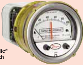
Series 43000 Capsu-Photohelic® Switch/Gage with Brass Body