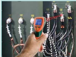
Fast response captures hot spots