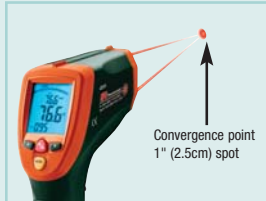
Two laser points converge at a distance of 50"/127cm ) and form a 1" (2.5cm) spot.