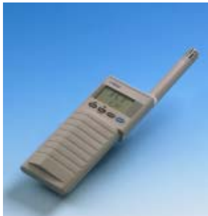
The HMI41 Indicator with the HMP41 Probe.