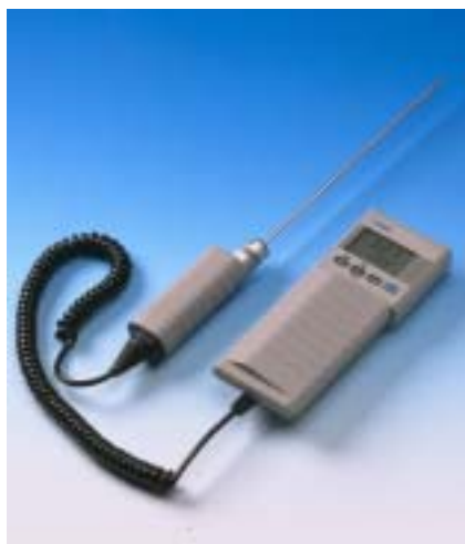
HMI41 with the HMP42 Probe.