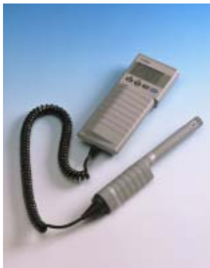
HMI41 with the HMP45 Probe.