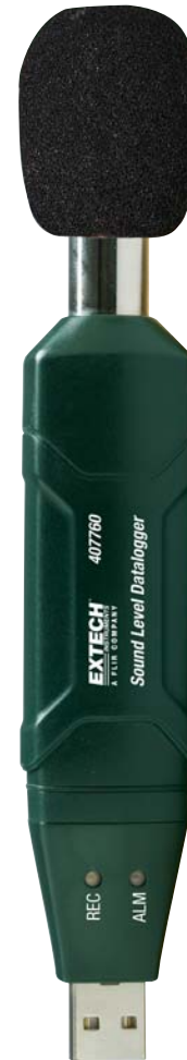
USB connector plugs into PC for quick downloading of Sound Level data to be analyzed using the software included