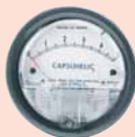
Flush mounted in panel.

Capsuhelic® gages may be flush mounted in a panel or surface mounted. Hardware is included for either. For flush mounting, a 4-13/16" diameter cutout in panel is required. Where high shock or vibration are problems, order optional A-496 Heavy Duty flush mount bracket. Optional A-610 kit provides simple means of attaching gage to 1-1/4"-2" horizontal or vertical pipe. Installation is same as Magnehelic® gage shown on page 4. All standard models are calibrated for vertical mounting. Gages with ranges above 5 in. w.c. can be factory calibrated for horizontal or inclined mounting on special order.