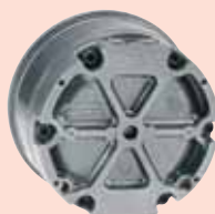
Back view for surface mounting.