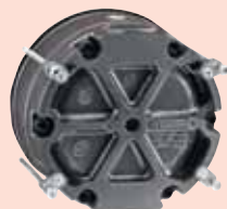
Back view shows flush mounting adapters.