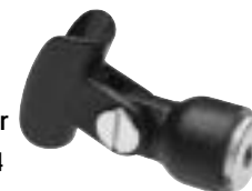
Tripod Mount Microphone Holder Model No. 00184