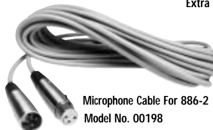
Microphone Cable For 886-2 Model No. 00198