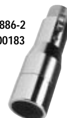
Extra Microphone For 886-2 Model No. 00183

Sound pressure level calibrators are used before or after taking measurements with sound level meters and noise dosimeters. The 890-2 can adjust Simpson models 886-2 and 884-2 or other sound level meters with a 1" diameter Microphone. The 890-2 provides a constant 94 dB or 114 dB sound pressure level at 1 KHz (0 dB = 0.0002 Mbar). Calibrator is immune to a wide range of temperature and humidity conditions while maintaining tight output level tolerances.