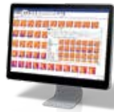
FLIR Thermal Studio Pro 1 year Subscription