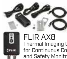
FLIR AX8 Thermal Imaging Camera for Continuous Condition and Safety Monitoring and Starter Kit