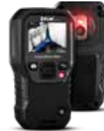
FLIR MR160 FLIR Imaging Moisture Meter