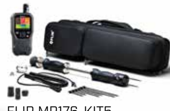
FLIR MR176-KIT5 Professional Imaging Moisture Kit