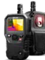
FLIR MR176 IGM™ Moisture Meter with Replaceable Hygrometer