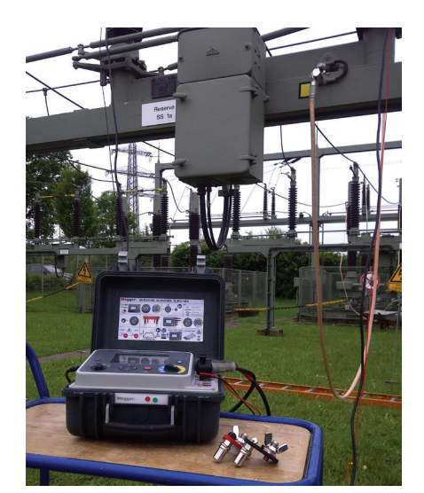
DLRO100 testing circuit breaker