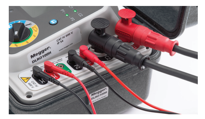
Robust, high-current CATIV leads for Kelvin configurations; current clamps for measurement on circuit breakers