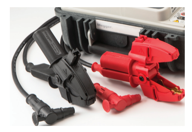
A new tough adjustable clamp has been designed to ensure flexibility in many applications and provides a good connection with the test piece