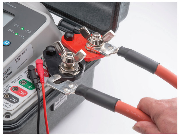
A new terminal adapter has been designed to enable the use of users own test leads.