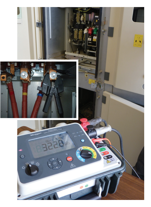
DLRO100H testing rack-mounted, 3-phase circuit breakers