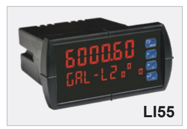
Commander™ Multi-Tank Level Controller Level Controller