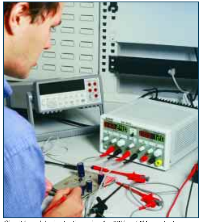
Circuit board design testing using the 30V and 5VDC outputs