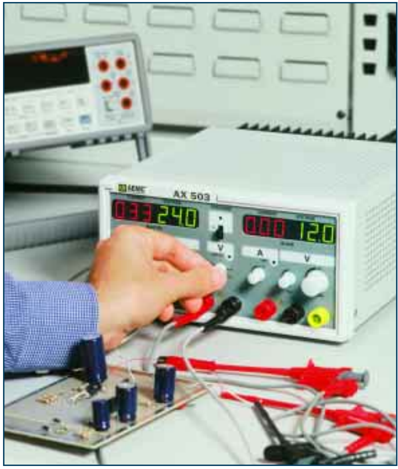
Voltage levels and current limits are easily adjustable from the front panel.

The AEMC® AX Series of Linear Power Supplies are designed for use in a wide variety of applications. They are equally at home in the precise