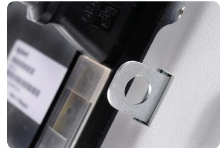
Physical lock mechanism as illustrated

Essential security features: Over-voltage protection (OVP)/ Over-current protection (OCP), keypad lock and physical lock mechanism