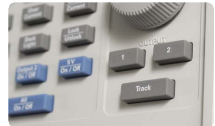
Figure 3. Simplifies Output 1 and Output 2 setup with tracking feature