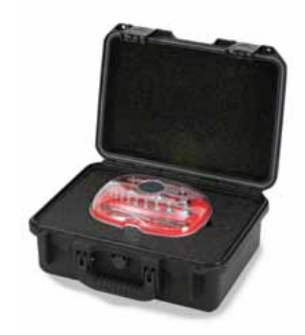
500 g through 1 mg case shown Dimensions: 13" L x 9.2" W x 6" H (33.0cm x 23.4cm x 15.2cm)