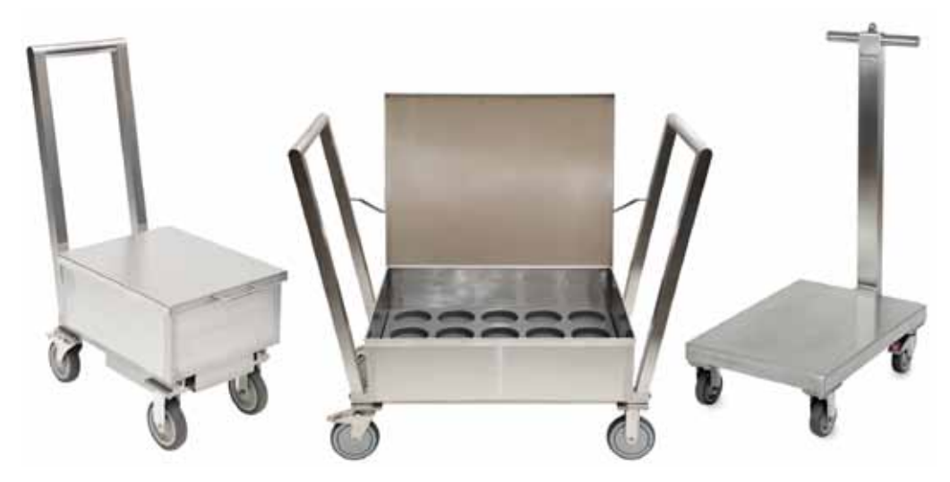
Shown from left to right: Stainless Steel Storage Cart, Stainless Steel Calibrated Storage Cart with double handles, Stainless Steel Calibrated Weight Cart