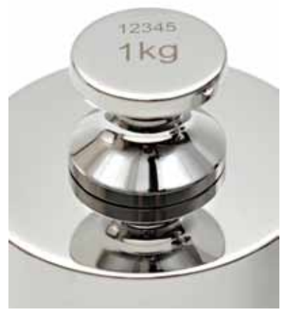
Laser Etching Serialization

Etching or Stamping your weight(s) provides traceability of your weights as they move throughout your facility. Weights can be etched or stamped with a serial number or ID number that matches those on your Weight Calibration Certificate.