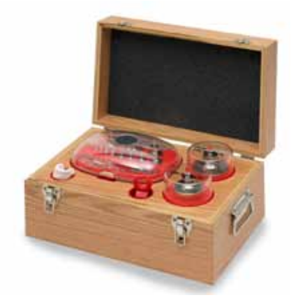
2 kg, 1 kg and 500 g case shown Dimensions: 15" L x 10" W x 7.5" H (38.1cm x 25.4cm x 19.5cm)