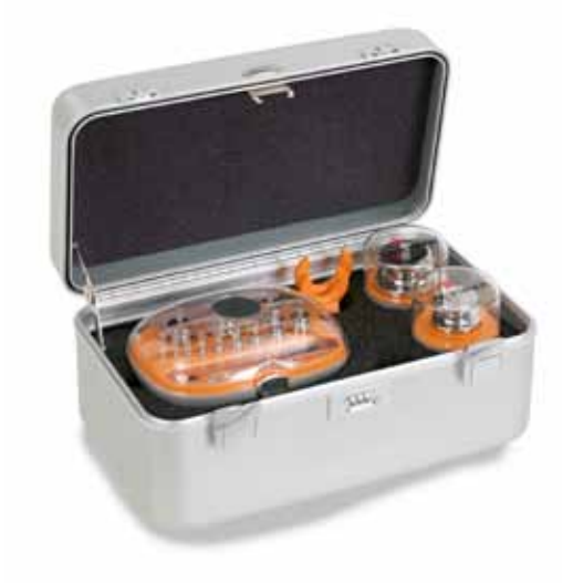
2 kg and 1 kg case shown Dimensions: 16" L x 9" W x 8" H (40.6cm x 22.9cm x 20.3cm)

There are no standard Aluminum Cases for weight sets available within the Stainless Steel Test Weight style. To order custom weight cases, call 800-249-5554.