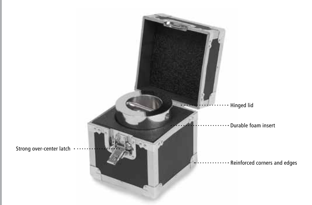
16 kg, 20 kg, 25 kg, 30 kg case shown Dimensions: 8" L x 8" W x 9" H (20.3cm x 20.3cm x 22.9cm)