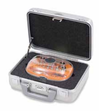
500 g through 1 mg case shown Dimensions: 12" L x 9" W x 5" H (30.5cm x 22.9cm x 12.7cm)