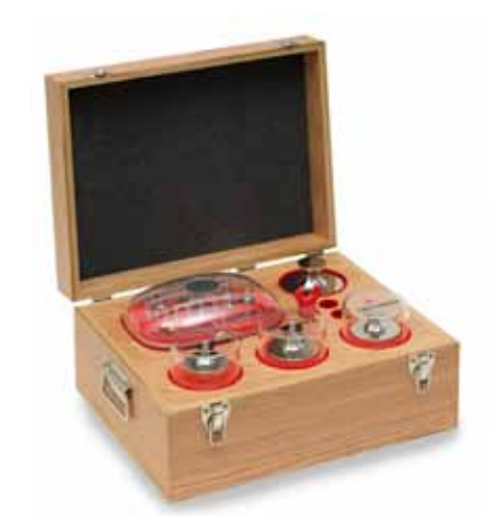
5 kg through 1 mg case shown Dimensions: 16" L x 13" W x 7.5" H (40.6cm x 33.0cm x 19.1cm)

There are no standard wood set cases available for Stainless Steel Test Weight style. To order custom weight cases, call 800-249-5554.