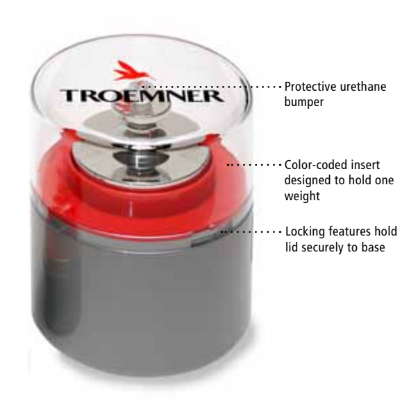
Large size holds 2 kg through 500 g Dimensions: 3.5" Dia. x 4.5" H (8.9cm x 11.4cm)