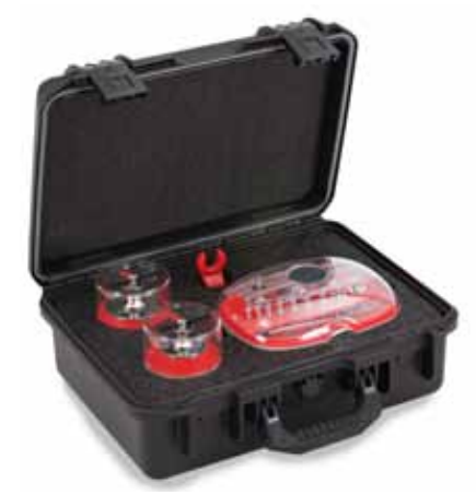
2 kg and 1 kg case shown Dimensions: 16.2" L x 12.7" W x 6.6" H (41.2cm x 32.3cm x 16.8cm)

Contact Troemner for Heavy-Duty cases for your Avoirdupois and Metric Test Weight Sets at 800-249-5554.