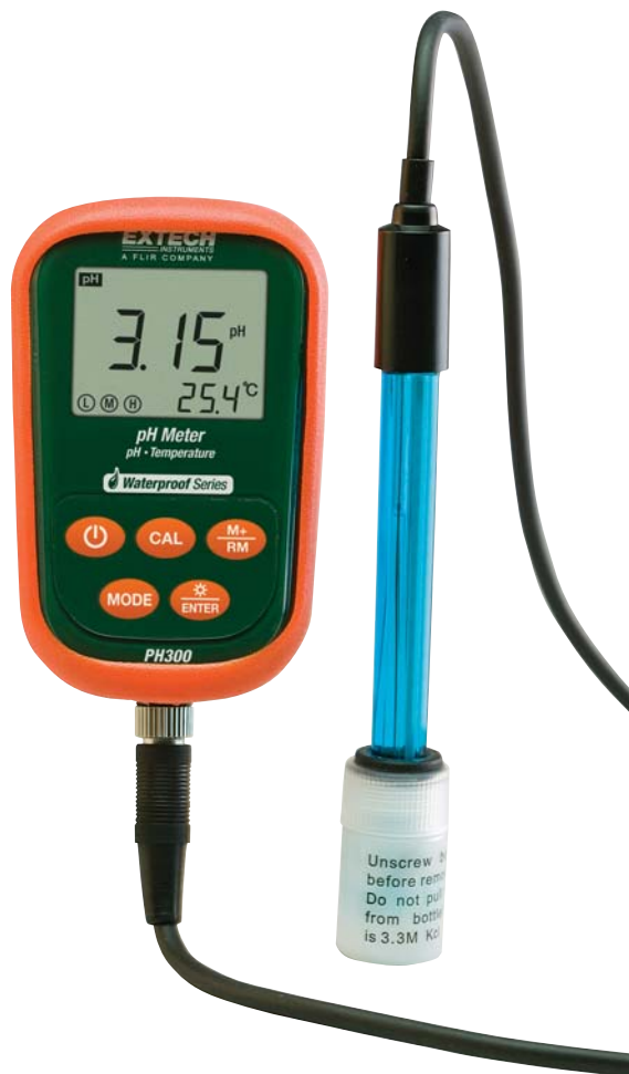
Large blue backlit dual LCD display with calibration and memory indicators