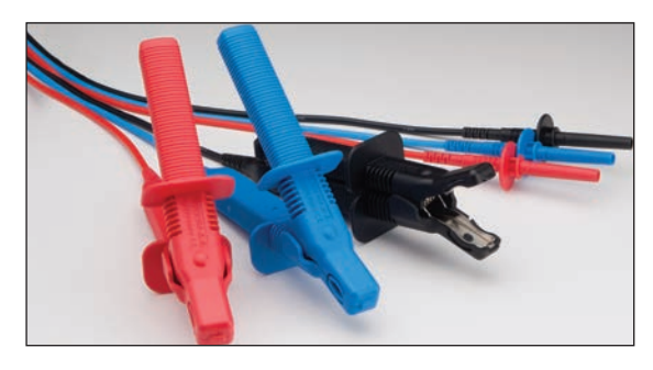
High quality flexible silicon insulated test leads with test clips meet IEC 61010. (Large clips shown.)