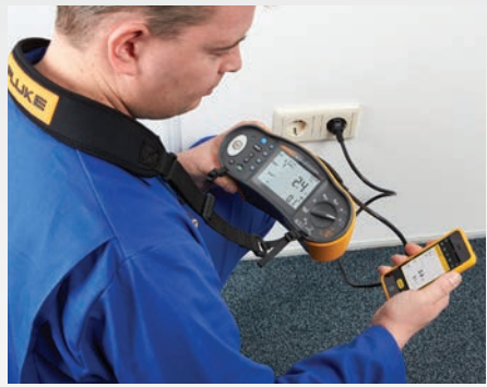
Fluke Cloud™ Storage Flexible and secure data storage from the field