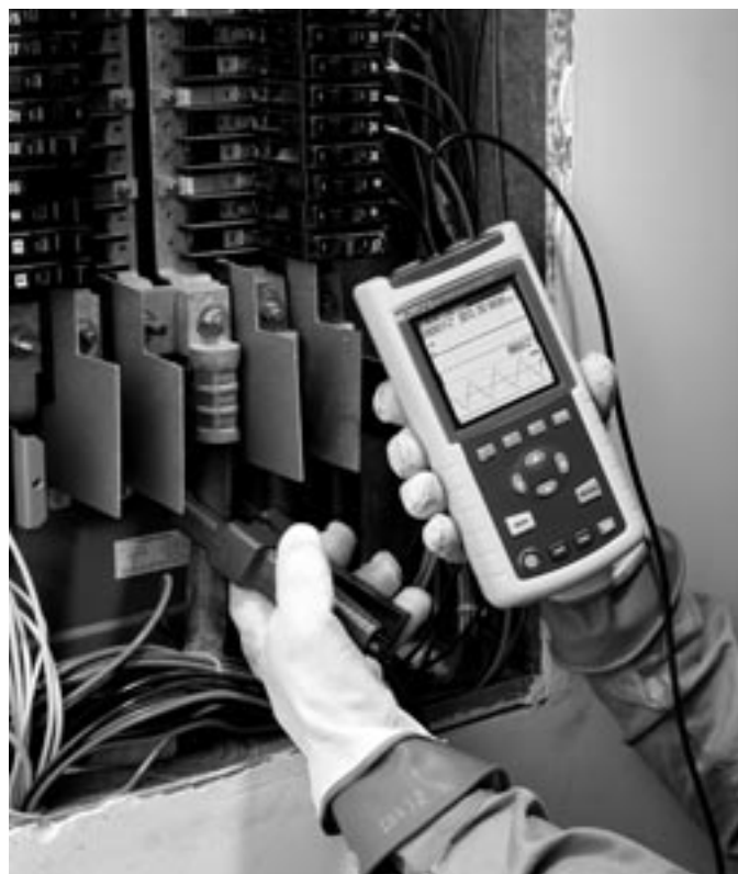
Fluke 43B Power Quality Analyzer