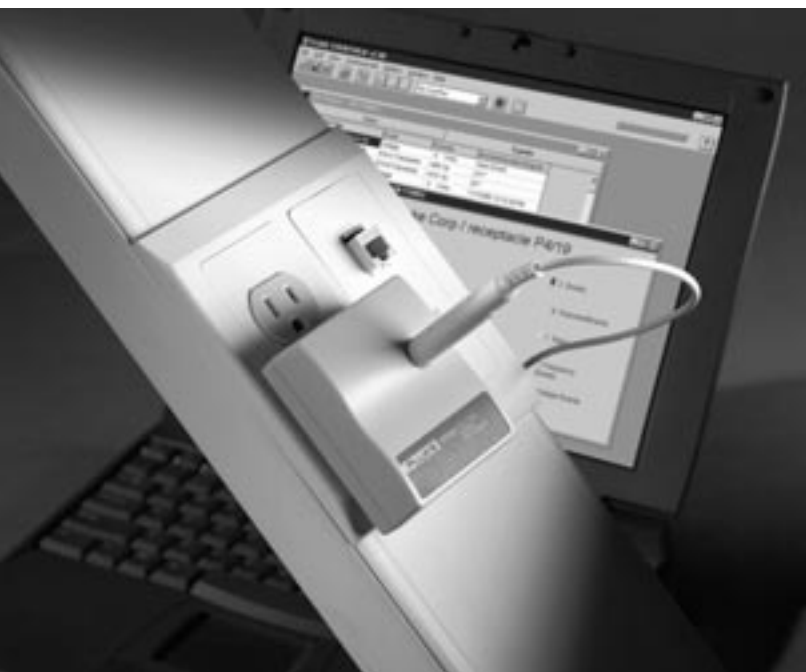
Fluke VR101S Voltage Event Recorder System

Before you do repairs, try to complete your analysis. If you see something strange, look for a root cause; something that would explain all or most of the symptoms. Before you change anything, record the "as found" condition at the input and output of the point of repair. For example, if you repair a connection in a distribution panel, test for electrical characteristics on each side of the connection before and after repair. The more active the component, the more this practice is crucial. Never repair or replace motors or transformers without taking "as founds."