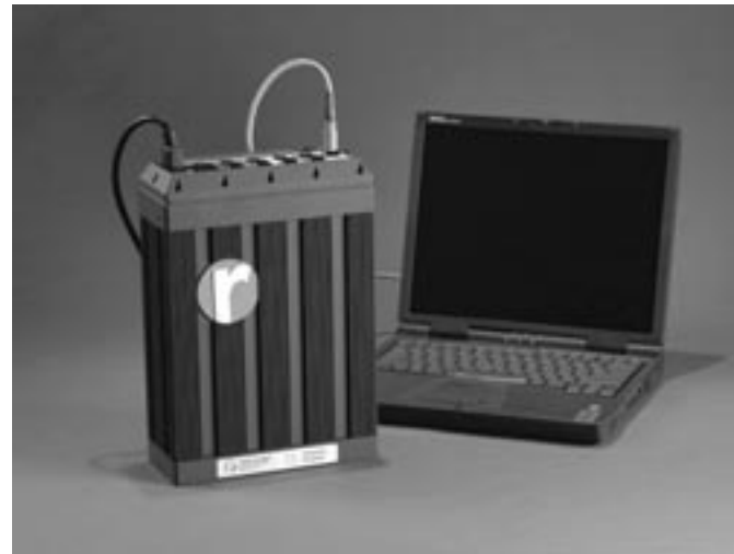
Fluke Portable Power Recorder.

Remember, the quality of the power is likely to vary throughout your facility. Even power from the same feeder may appear "dirty" at some loads, but clean to other equipment — power quality will tend to be worse, the farther you get from a transformer.