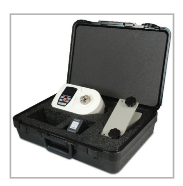
ST002 Carrying case Provides storage space for the TT02 tester, rundown fixtures, bench mounting kit, AC adapter, and accessories.

ST001 Bench mounting kit Mounts the TT02 securely to a bench for horizontal orientation.