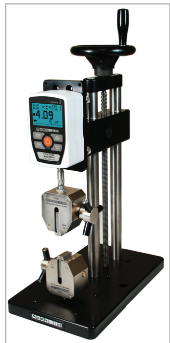
Shown with an ES20 test stand and G1061 wedge grips