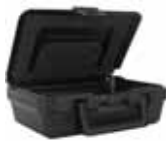
Protective Carrying Case