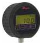
DPG-100 with Protective Rubber Boot