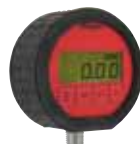
DPG with Protective Rubber Boot