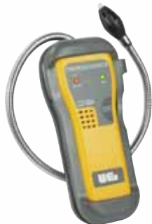
CD100A Combustible Gas Leak Detector (L336)

Perform adjustments to the appliance, and then recall the highest level of CO with the CO Max function. With the temperature function you are able to test register outlet temperatures, or monitor stack gas temperature.