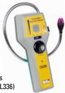
CD200 Combustible Gas Leak Detector (L336)