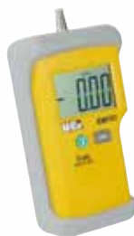
EM151 Single Input Electronic Manometer (L335)