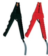
Kelvin clips, set of two, (10A) 10 ft Catalog #1017.84