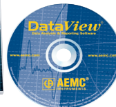
DataView® is included with the Model 6240