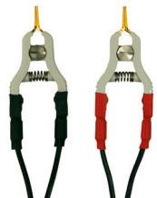
Kelvin clips, set of two, (1A) 10 ft Catalog #1017.83