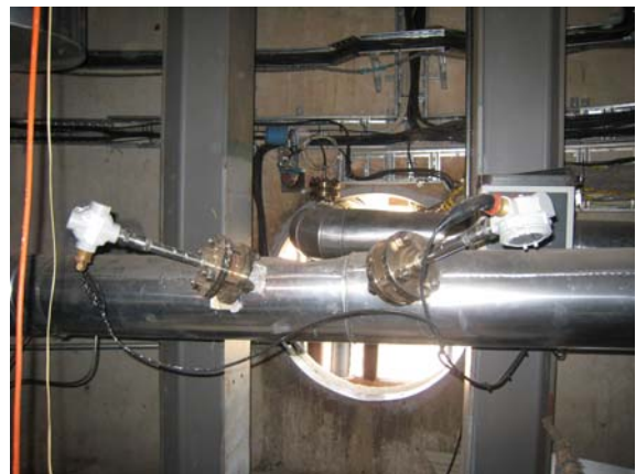
PanaFlow, BWT with FTPA buffers installed on pipe inlet

PanaFlow is installed in a spool piece section of the nitrate salts inlet pipe leading to the heat exchanger (see figure, right), where the operating temperatures range from 290°C up to 550°C at an average pressure of 1.5 barg. Bundle Waveguide Transducers (BWTs) are installed using FTPA buffers that allow easy installation or removal of the wetted transducers without interrupting the salts flow or emptying the pipe. The unique BWT transducers use waveguide bundles to efficiently concentrate a greater amount of the transducer