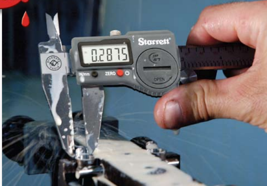
798 Electronic Slide Calipers have IP67 Protection against dust, dirt, water and coolant

Available with measuring capacities to 12" (300mm), these full-featured electronic slide calipers are built with customary Starrett quality and workmanship.