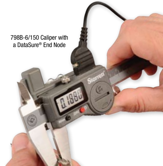
798B-6/150 Caliper with a DataSure® End Node