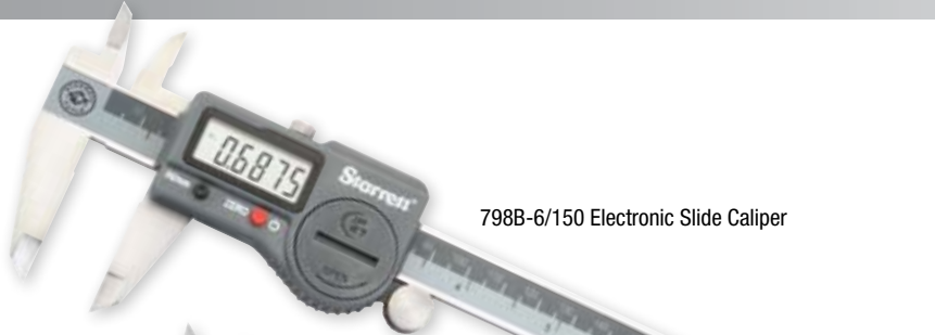
798B-6/150 Electronic Slide Caliper