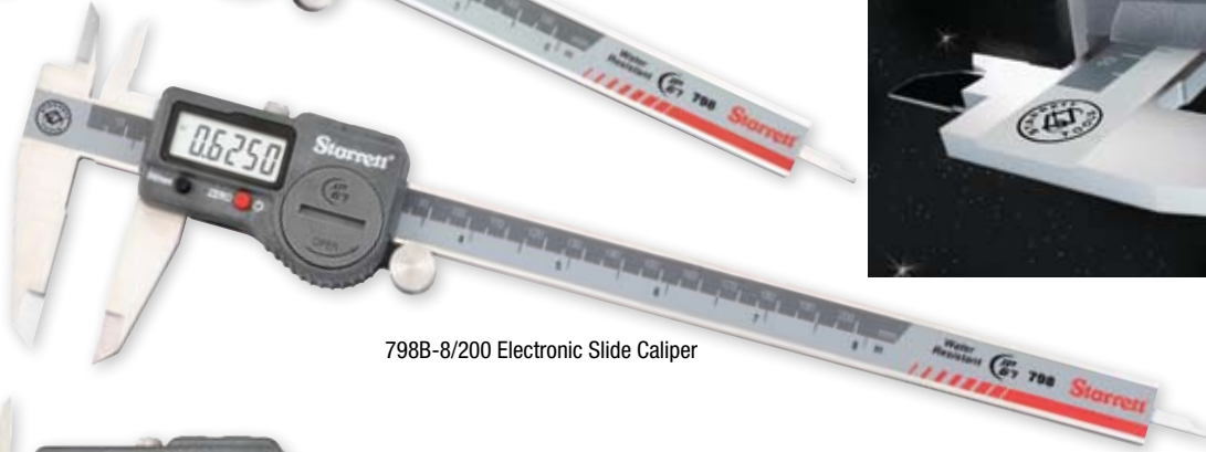
798B-8/200 Electronic Slide Caliper