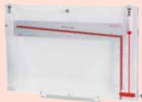
424-10 Inclined-Vertical Manometer.

Suitable for Total Pressure up to 100 psig, Temperatures up to 150°F