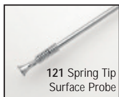
121 Spring Tip Surface Probe