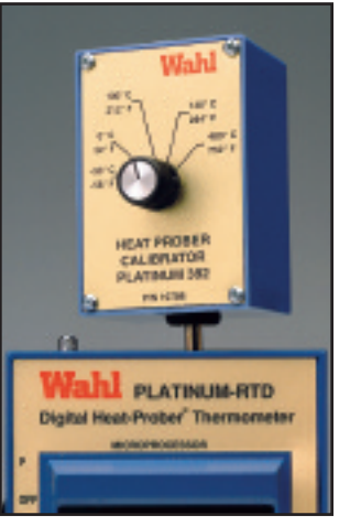
Platinum RTD Meter 392MF shown with 5-point calibrator CAL392-HT

All 392 Series Meters assure laboratory accuracy in the field when used in conjunction with the NIST traceable Calibrator CAL392.