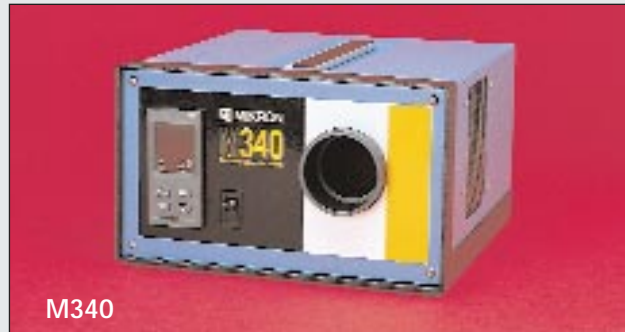
Precision Low Temperature

The M340 is a portable blackbody calibration source covering the range from sub-zero to 100^{\circ}\text{C} with 0.1^{\circ}\text{C} resolution. The thermoelectric heating/cooling mechanism is utilized to achieve a compact and easy-to-use blackbody source. The M340 has unusually high temperature stability and a stabilization time of only 10 minutes. Source temperature is closely controlled by a self-tuning PID controller which displays temperature in a digital readout.